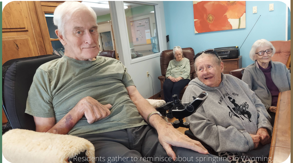
Residents gather to reminisce about springtime in Wyoming.

Spring Has Sprung -1 Letter From The Administrator -2 Spring Poem by Rich -2 May Birthdays -2 Coming Up -2 Word in The Center: Nurses Day -3